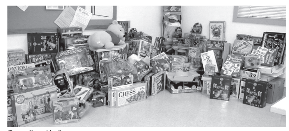
Toys collected by Stege.

For those families who would benefit from the program, applications are available through the Richmond YMCA.