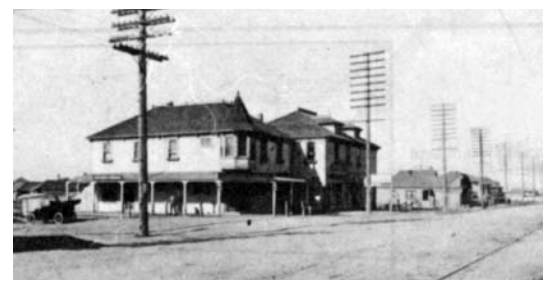
Stege junction in 1913

n May 15, 2013, Stege Sanitary District will celebrate 100 years of service to the communities of El Cerrito, Kensington, and Richmond Annex. To get ready for this historical event, Stege is compiling a history of the District. Do you have any anecdotes or memories of the District you would like to share? Do you have photographs or news clippings that help tell the story of Stege? If so, the District would love to hear from you. Either write to 7500 Schmidt Lane, El Cerrito, CA 94530-0537 or email <u>Staff@StegeSD</u>. dst.ca.us.